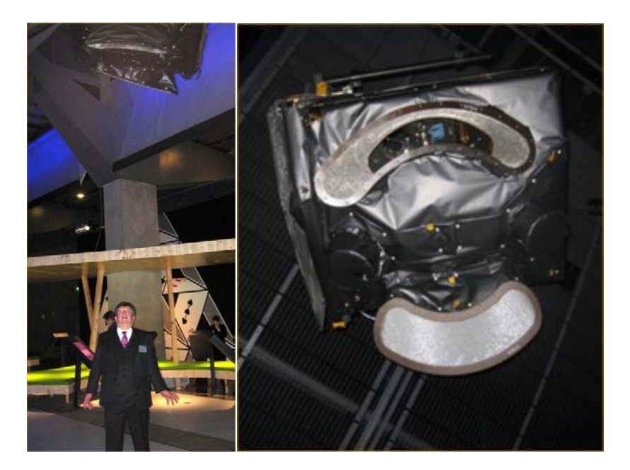
Figure 1: In London's Science Museum, the AATSR Structural/Engineering Model is on display as part of their new exhibition "Atmosphere – Exploring Climate Science". The panel on the left includes an example of an anthropogenic species for scaling purposes.

In this synopsis, some of the most important of the many lessoned learned from the mission are briefly described.